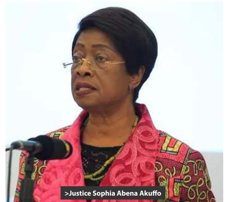
>Justice Sophia Abena Akuffo

A vehicle of top level chief executive of a state agency was used to ferry her to the airport allowing her to use the VIP Lounge.