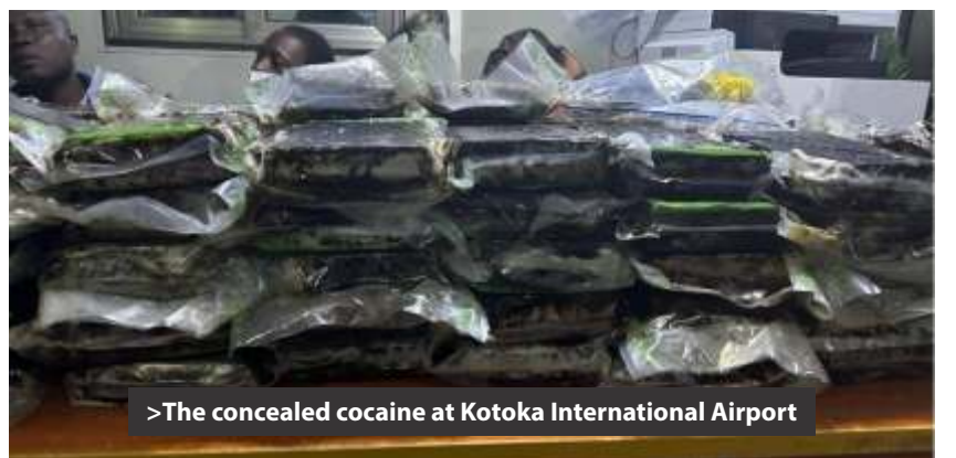
>The concealed cocaine at Kotoka International Airport