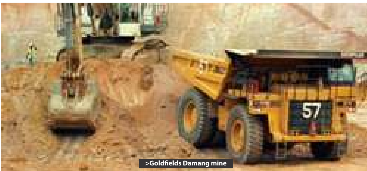
>Goldfields Damang mine

Additionally, he is an active member of the Marine Manpower Development Think Tank, which is championing the creation of a marine manpower bank to provide seafaring and maritime job opportunities to Ghanaian youth.