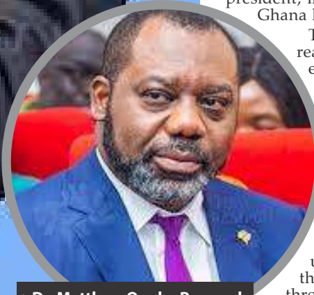
&gt;Dr. Matthew Opoku Prempeh

He emphasized that ensuring the unity of the party is paramount and that he is committed to seeing that through.