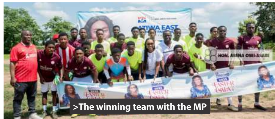
>The winning team with the MP

The African Schools Football Championship 2025 promises to be an exciting tournament, with several talented teams vying for the top prize.