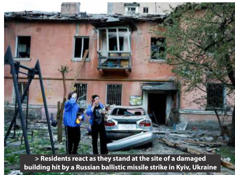
> Residents react as they stand at the site of a damaged building hit by a Russian ballistic missile strike in Kyiv, Ukraine

The White House has threatened to abandon its efforts if no progress is made soon. Trump upbraided Zelenskiy on Wednesday over a comment in which the Ukrainian repeated that