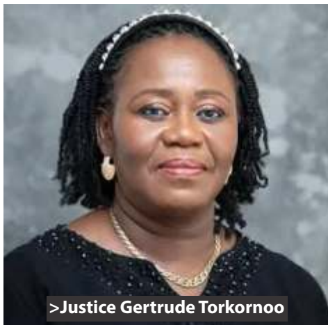
> Justice Gertrude Torkornoo