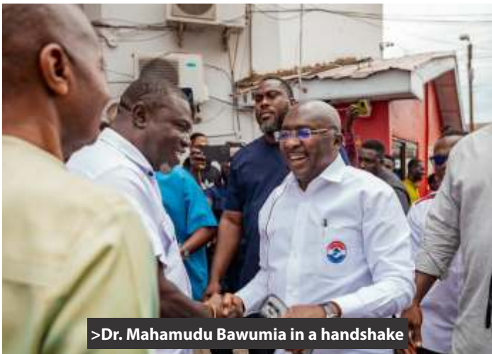
>Dr. Mahamudu Bawumia in a handshake