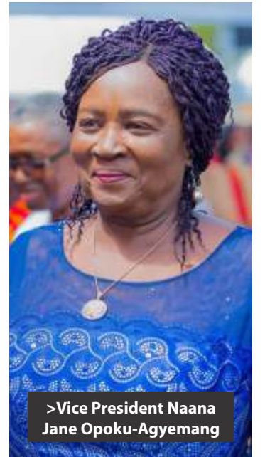
>Vice President Naana Jane Opoku-Agyemang

Communications Minister, Felix Kwakye Ofofu, later revealed that medical specialists had advised the Vice President to pursue further treatment abroad as a precautionary measure. She was subsequently flown out to London.