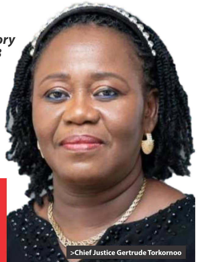
>Chief Justice Gertrude Torkornoo