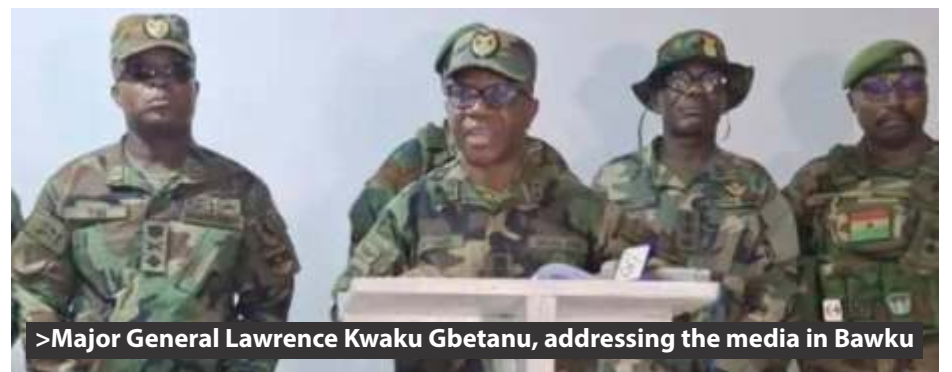
> Major General Lawrence Kwaku Gbetanu, addressing the media in Bawku

The Bar reaffirmed its mandate to act as the guardian of the justice delivery system, pledging to continue serving as the "voice of the voiceless" and to defend the Constitution.