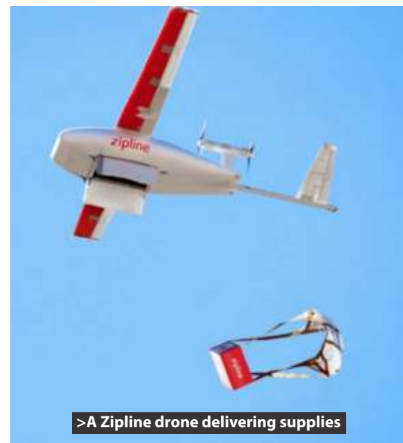
>A Zipline drone delivering supplies

Others allege that the dismissal of Dr. Atiku was politically motivated to pave the way for an NDC party loyalist.