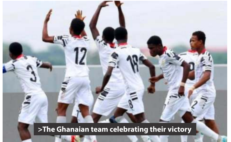
>The Ghanaian team celebrating their victory

The potential move would be a significant coup for Al Nassr, who are looking to strengthen their squad with top talent.